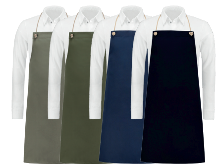
Spanish One 309001