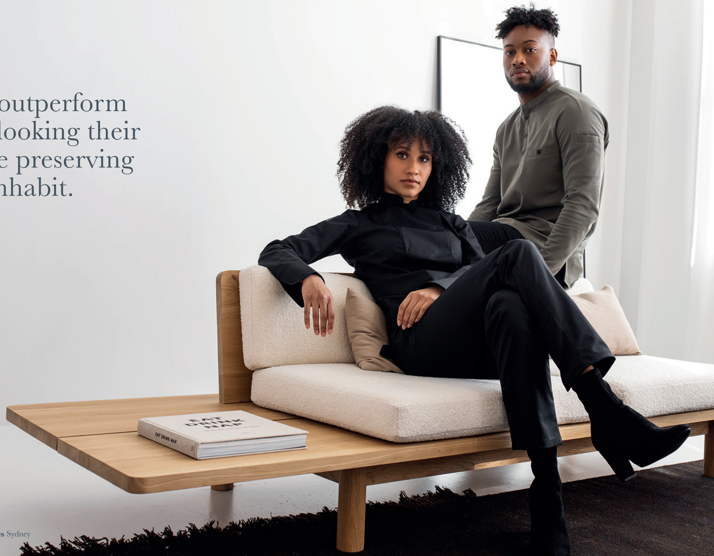
From left to right: Chef Jacket Lynn, Pants Oregon, Chef Jacket Elias, Pants Sydney

We help chefs outperform themselves by looking their very best, while preserving the world we inhabit.