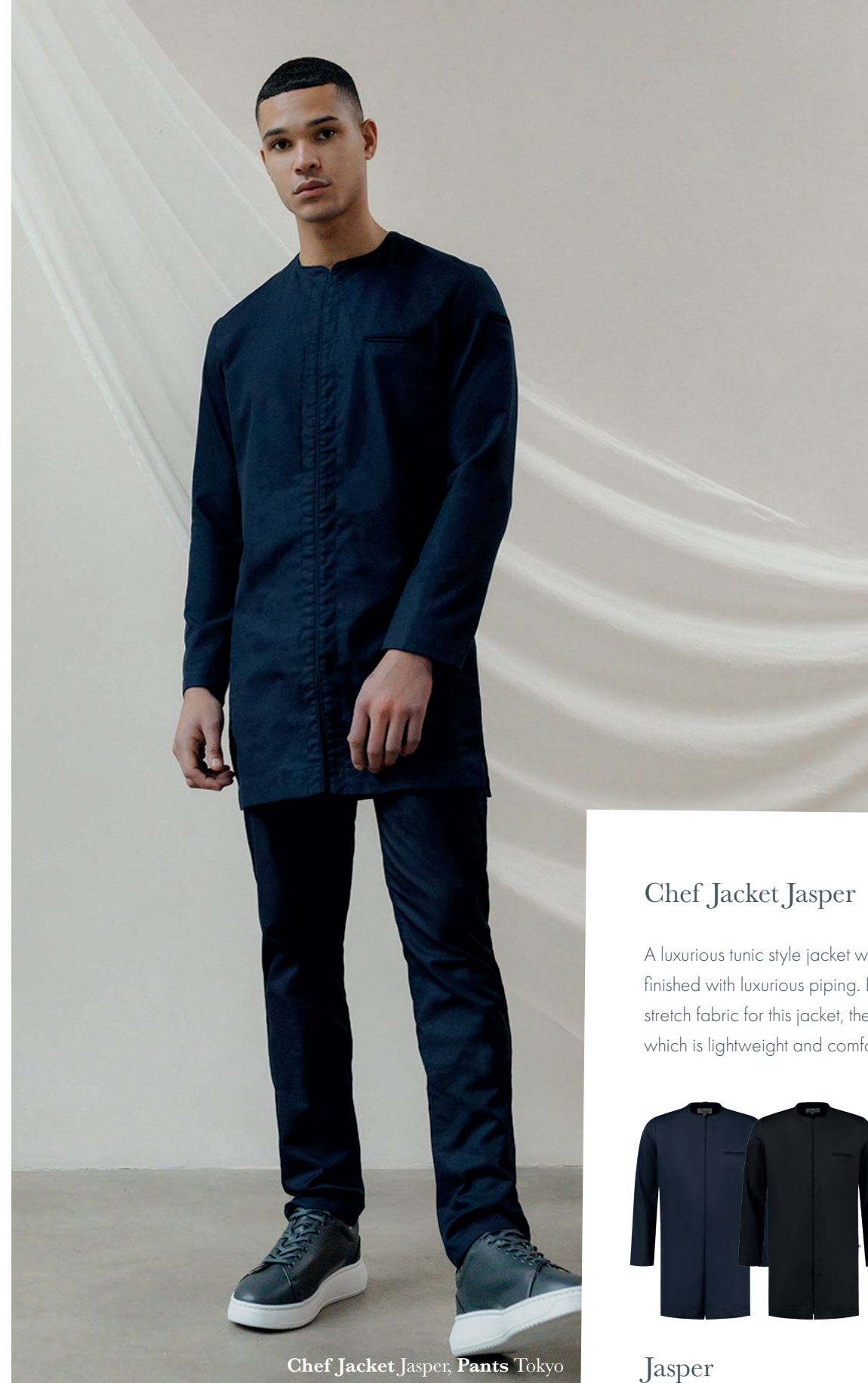
Chef Jacket Jasper, Pants Tokyo