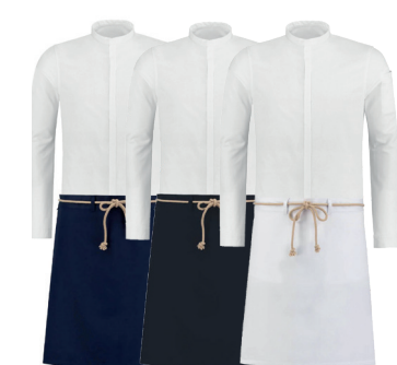
Spanish Short 401181