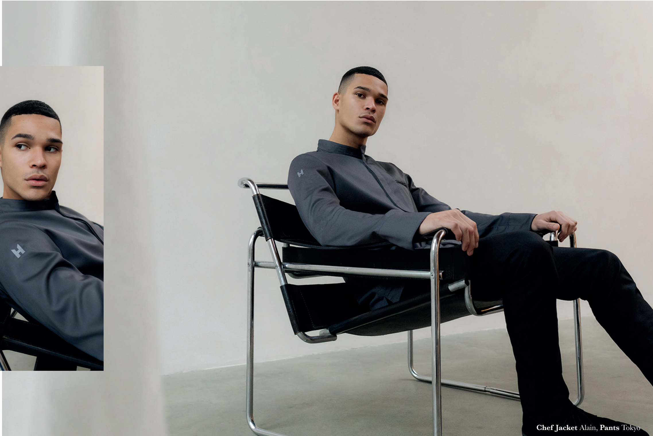
Chef Jacket Alain, Pants Tokyo