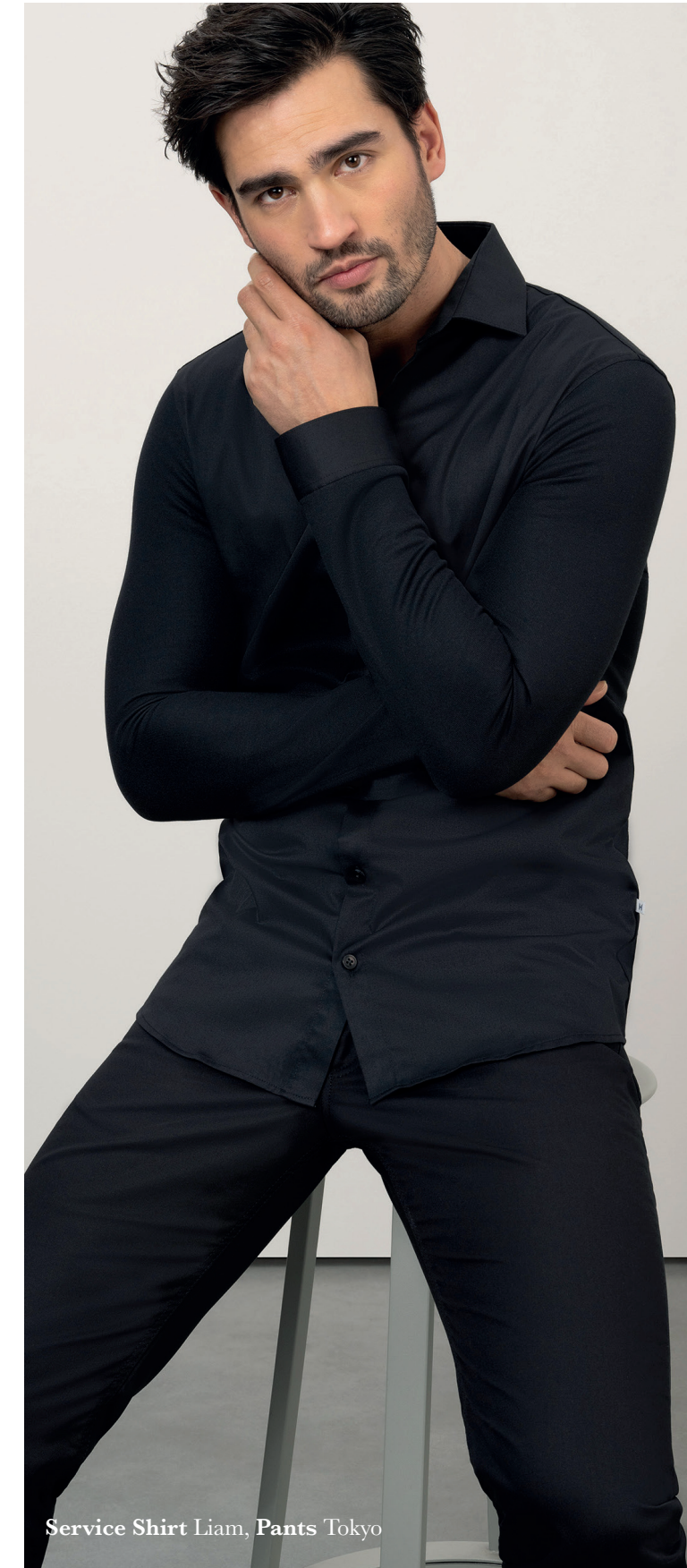
Service Shirt Liam, Pants Tokyo