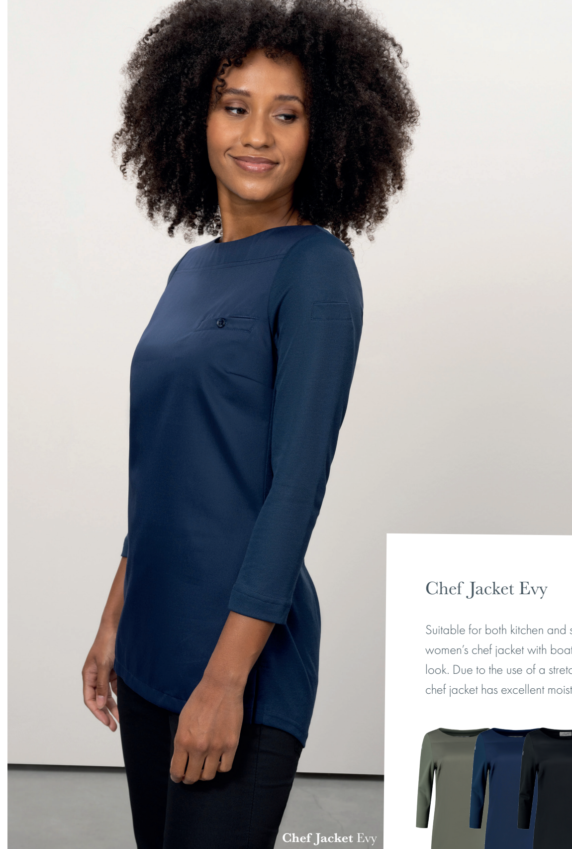
Chef Jacket Evy

Suitable for both kitchen and service employees, this women's chef jacket with boat collar gives a polished look. Due to the use of a stretchy polo-pique fabric, this chef jacket has excellent moisture regulation.