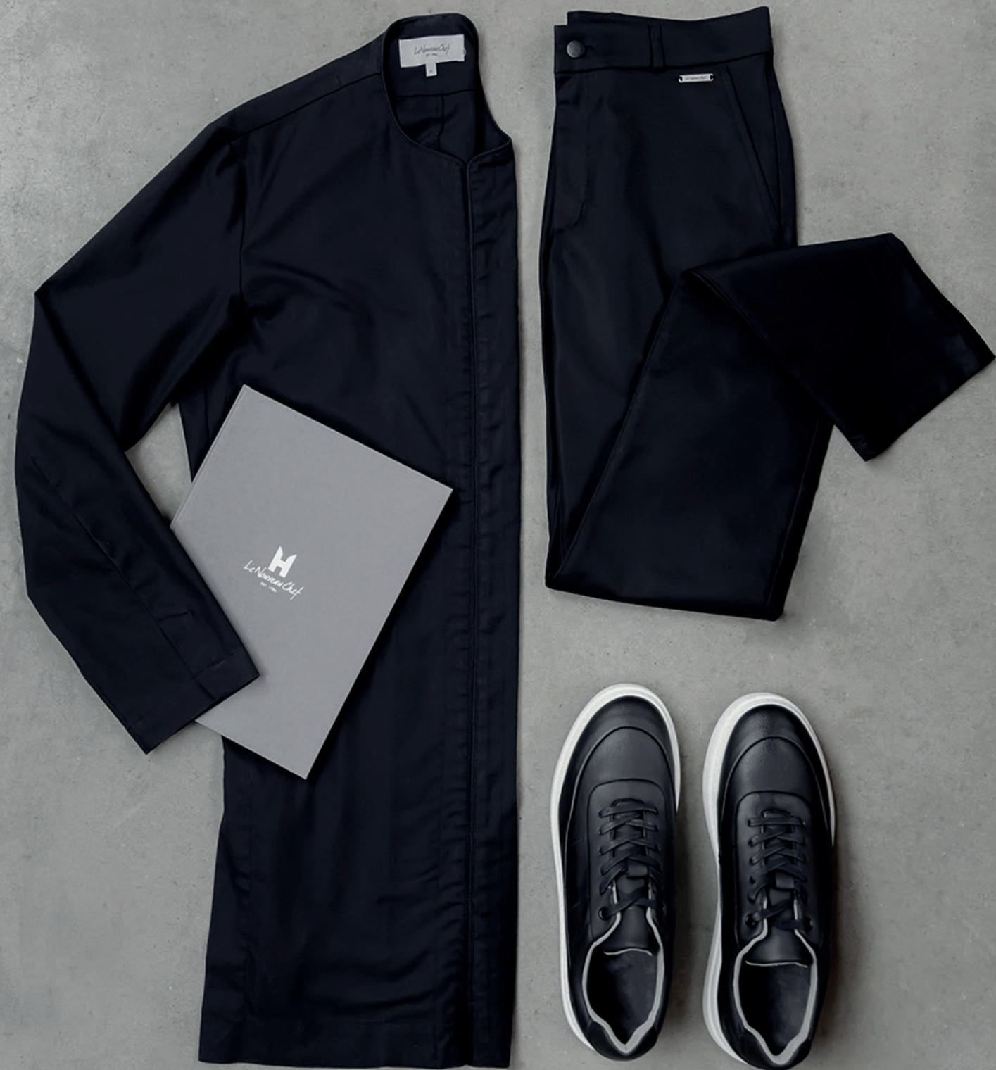
Chef Jacket Jasper, Pants Tokyo